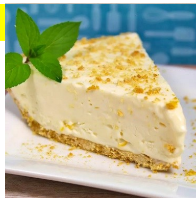
5 Ingredient Lemon Pie In 10 Mins + Chill

Step 1 - Mix together the cream cheese, milk and lemon juice. Mix well and spread in graham crust. Chill until set, at least 2 hours, and top as desired.